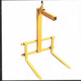
AUTO-LEVELING PALLET FORKS