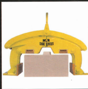
LOCK BLOCK LIFTERS

LIFTING CHAINS TOWER CRANE LIGHTS DEP BOX ILLUMINATED SIGN BOX PIG TAIL SPREADER BARS OUTRIGGER PLATFORMS